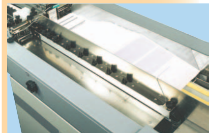
FD 2200 EX

** Three phase power is required. NOTE: The FD 2200-EX model requires both a 3-phase 220V outlet and a second separate 220V outlet (single phase) for the extended airfeed deck.