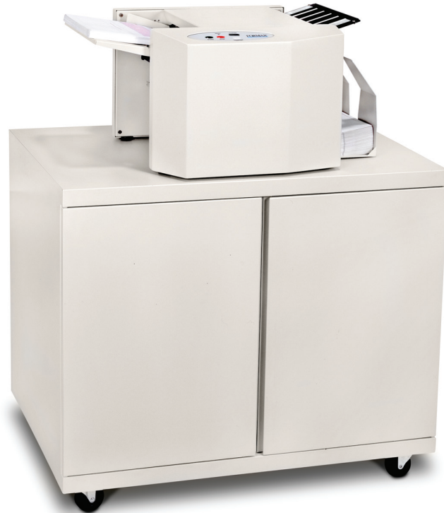
Shown with optional cabinet

The FD 1500 AutoSeal ® is The low volume folder/sealer solution for processing one-piece pressure sensitive mailers. Built with proven Formax technology, the FD 1500 provides an economical solution with the quality and reliability you have come to expect from Formax. The sleek office design and ease of operation makes this unit ideal for processing documents in an office environment with low volume applications. A processing speed of up to 85 forms per minute enables operators to complete daily jobs with ease. The added capability of processing 14" forms gives the FD 1500 the versatility needed to fold and seal virtually any low volume application to meet your needs.