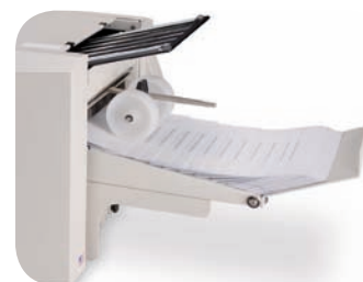
Integrated Output Conveyor

The FD 1500 Plus is built with proven Formax technology. Heavy-duty steel construction offers the dependability and power expected of a larger unit in a smaller package. A processing speed of up to 5,200 forms per hour enables an operator to complete daily jobs in no time. Plus, the integrated output conveyor keeps processed forms in a neat, sequential order.