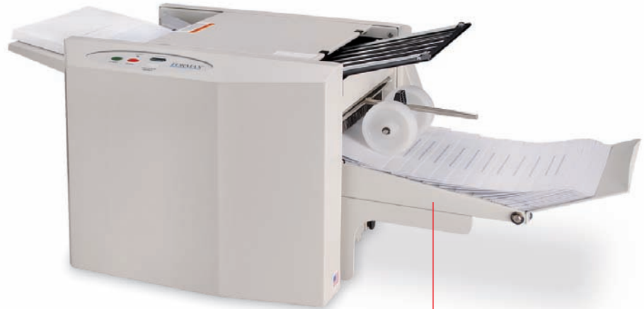
Integrated Output Conveyor