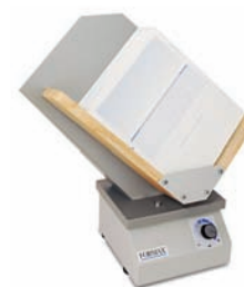
402 Series Jogger - an option which reduces static electricity from forms and aligns them for proper feeding

U.S. Patents: 5,772,841 5,865,925 5,968,308 6,264,592 Other Patents Pending