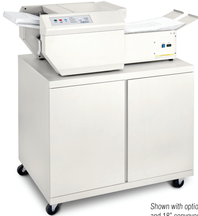
Shown with optional cabinet and 18" conveyor

The FD 2000 AutoSeal ® pressure sealer is a powerful desktop model designed to process pressure sensitive self-mailers. An easy to use touch-pad control panel and three-roller drop-in feed system make this product both practical and dependable. Standard features include a six-digit counter, jog control, fault detection, and LED indicators. Up to 200 forms can be loaded in the hopper and processed at speeds up to 7,000 forms per hour. The FD 2000 also has an optional fully enclosed cabinet for storage and an 18" or 4' conveyor with photo-eye for neat and sequential stacking of processed forms.