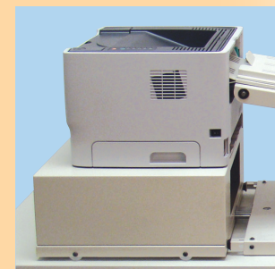
FD 2000-45IL Riser with HP/Troy P2015 Printer