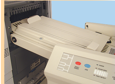
Enclosed paper path provides optimal document security