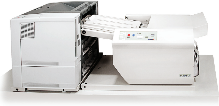
FD 2000IL System shown with IL Pressure Sealer and IL Alignment Base, laser printer (not included), optional conveyor and optional locking cabinets