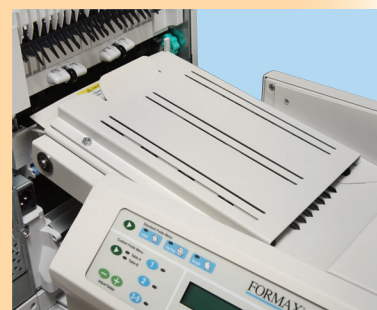
Enclosed paper path provides optimal document security