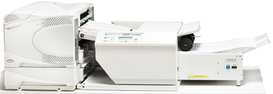
FD 2052IL System shown with IL Pressure Sealer and IL Alignment Base, laser printer (not included), optional conveyor and optional locking cabinets